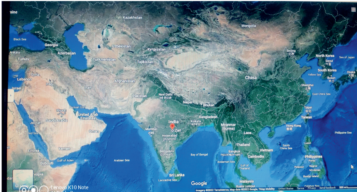
Fig. 2: Location of Map Erva-Jhari, Chandrapur, India