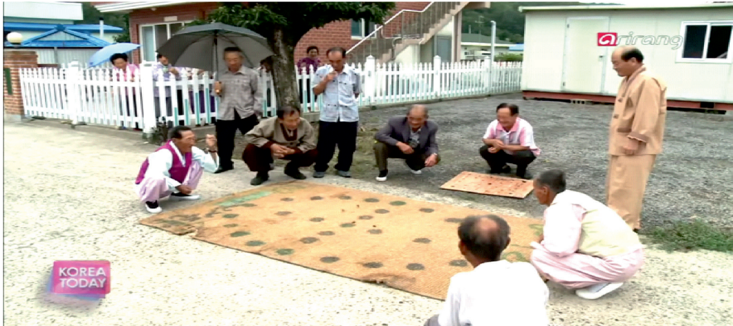
Fig. 4: Korean Nyout Game