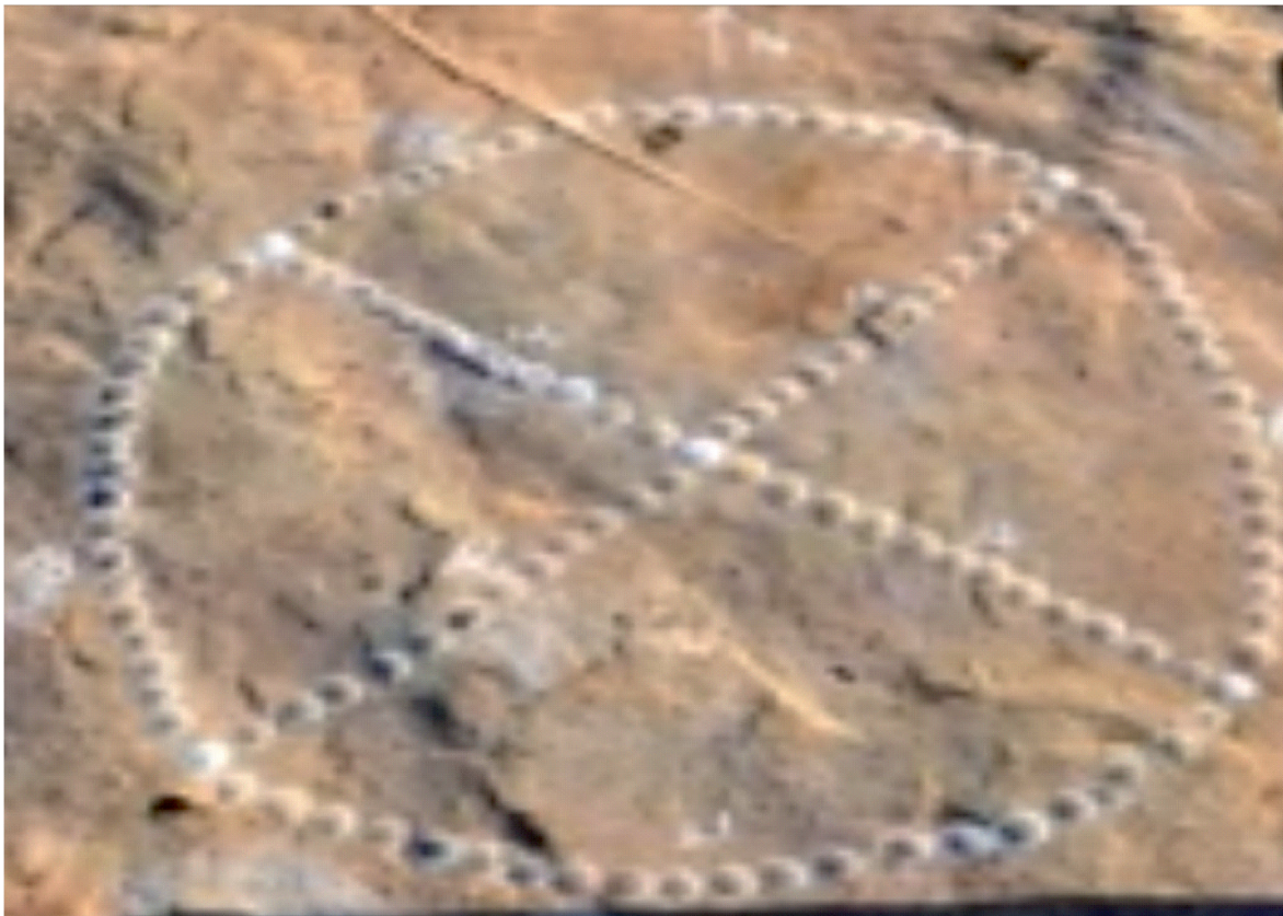
Fig. 3: Nyout (Circle and Cross) Game at Erva-Jhari, Chandrapur, India

cross & circle or cup-marks, but are the remains of an ancient board game which is totally vanished in India. In ancient India the name of this board is completely disappeared but this board game is still played in some of the south- eastern countries by various names "Yut-Nori/Yannori or Nyout". To welcome the New Year at the time of harvesting this board game has been played.